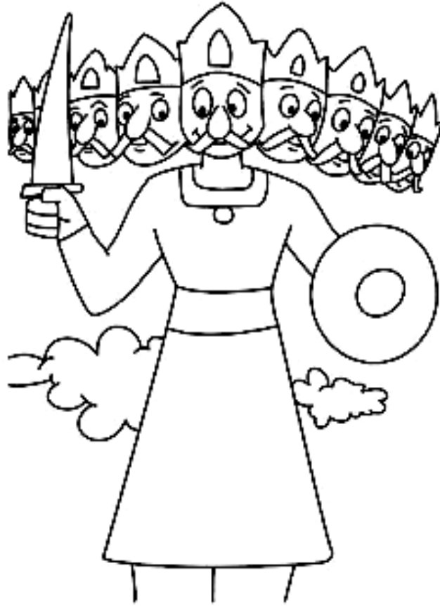
Colour the picture

We all enjoy delicious ‘KHICHADI’ in Durga Puja. Write down the names of ingredients used for preparing it.